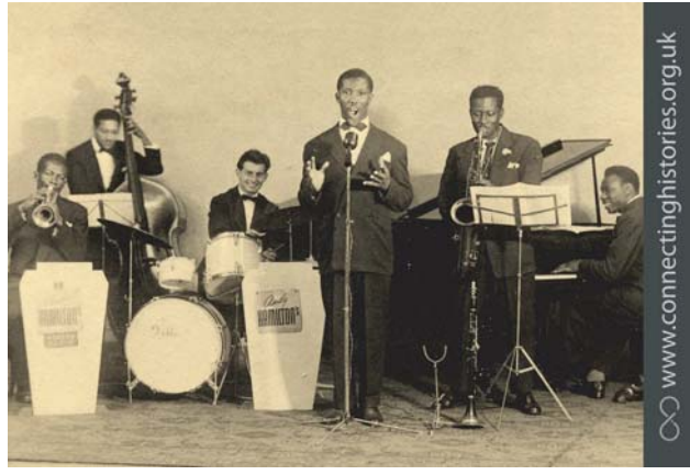
One of the twelve Connecting Histories postcards that are now available

The project team would like to thank all of the hundreds of people who have been involved or have supported the project in different ways.