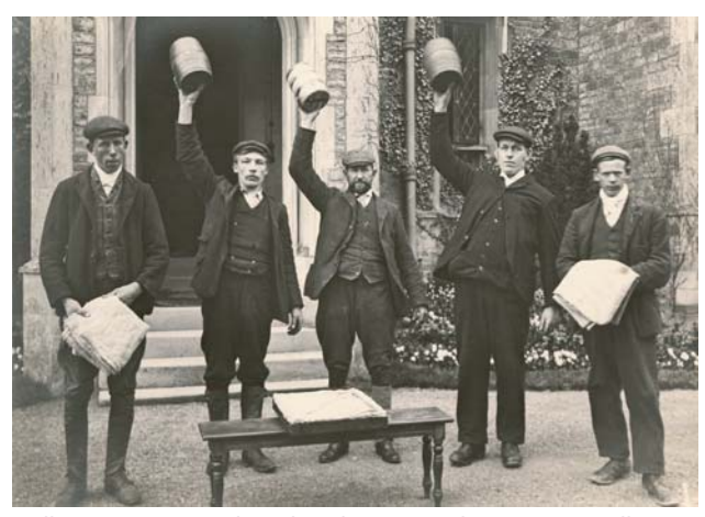
Hallaton 'Hare-Pie' and 'Bottle Kicking' Festival, 1905

The Connecting Histories project will come to a successful conclusion in July 2007. The project has been running since February 2005 and has involved Birmingham Libraries and Archives, the School of Education at the University of Birmingham, the Sociology Department at University of Warwick, and lots of individuals and community groups across the city. The project has produced catalogues of archives, learning materials on the histories of various communities in the city and a number of other resources which are all available on the Connecting Histories website.