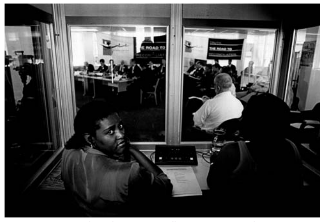
'Bearing Witness'.